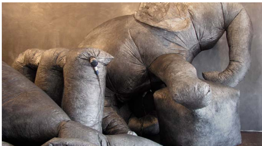
Benjamin Entner, Still Life , graphite on Tyvek, hairdryers / dimension varies / 2008

2008 "Benjamin Entner: Works on Paper" Kansas City Artists Coalition Mallin Gallery, KC, MO USA